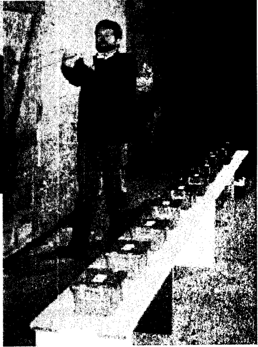
USING THE "PARALLEL RODS" TECHNIQUE, A DOWSER LOOKS FOR A SIGNAL AS HE PASSES THE TEN BOXES, ONE OF WHICH CONTAINS THE TARGET: A BAG OF GOLD COINS. ►