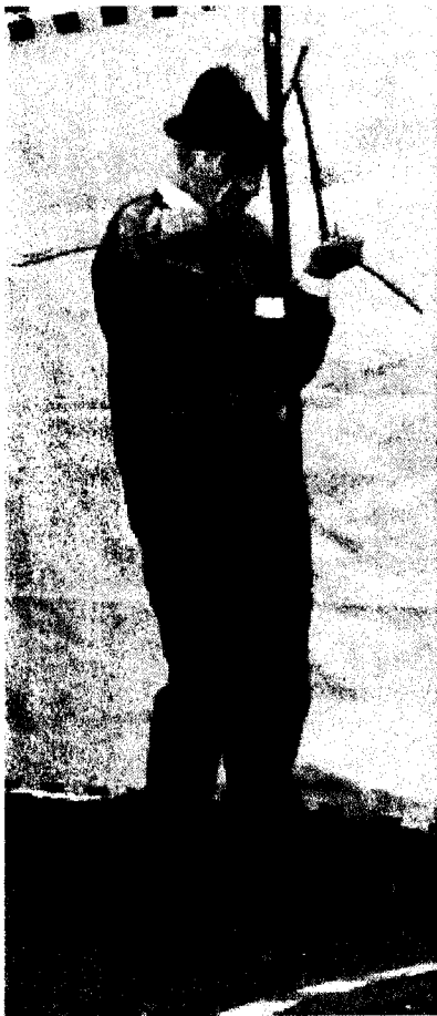
A BAVARIAN DOWSER INTENTLY APPROACHES THE MARKED POSITION OF THE BURIED PIPE, FORKED STICK AT THE READY.